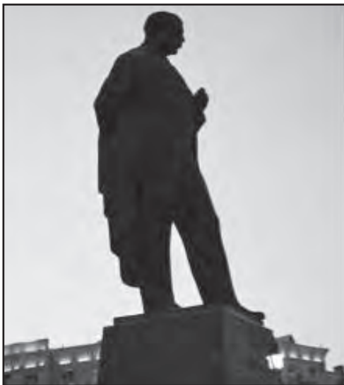
Narimonov Statue in Baku.

economic, and cultural sense Azerbaijan is still impacted by its Soviet legacy. Prominent Soviet Azerbaijanis such as Nariman Narimonov (Nəriman Kərbəlayi Nərimanov) and Meshadi Azizbekov (Məşədi Əzizbəyov) are commemorated in statues, parks, and town names.