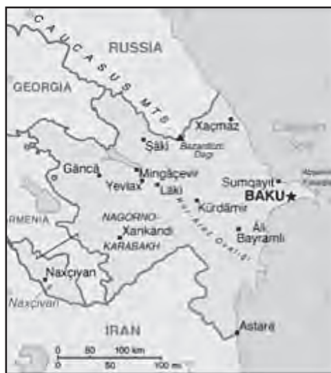
Map of Azerbaijan