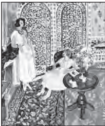
Figure 3: Henri Matisse, The Moorish Screen , 1921, oil on canvas, Philadelphia Museum of Art. In Henri Matisse: A Retrospective , by John Elderfield, 328. New York: The Museum of Modern Art, 1992.

Matisse also eschewed academic conventions by working in media that were not considered high art. Furthermore, throughout his career, he remained consistently interested in decorative objects such as screens, tapestries and rugs as motifs in his paintings. We can see this attraction to decorative objects in many of Matisse’s paintings, including, for example The Moorish Screen from 1921. In this painting, one can observe Matisse’s detailed attention to the specific designs on the screen, the wallpaper, and the rug—so much so that they nearly obscure the figures in the painting.