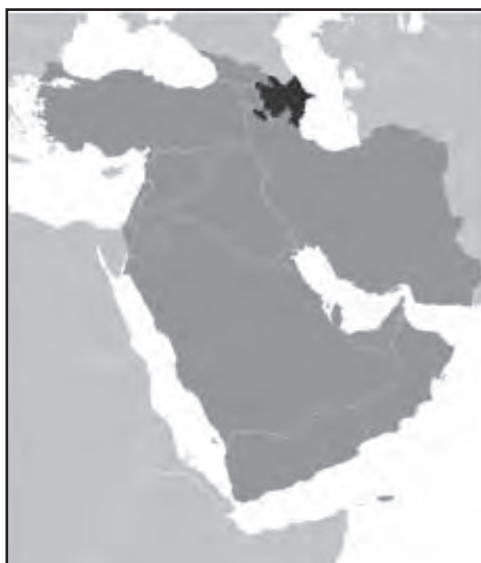
Map of Middle East highlighting Azerbaijan

For modern day Azerbaijanis, foreign intervention and interest in the region in the past were usually perceived to be instigated by economic motives, which meant state