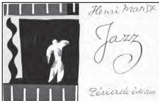
Figure 2: Henri Matisse, The Clown, Plate I from Jazz , 1947, twenty pochoir plates plus text, The Museum of Modern Art, New York. In Henri Matisse: A Retrospective , by John Elderfield, 423. New York: The Museum of Modern Art, 1992.

his career. In 1951, in an article called “Matisse Speaks,” the critic Tériade concludes by considering the cutout technique of Jazz : “It was Matisse’s genius that gave these colors life. He had invented a new means of plastic expression, and this will surely be an important date in his career.” 60