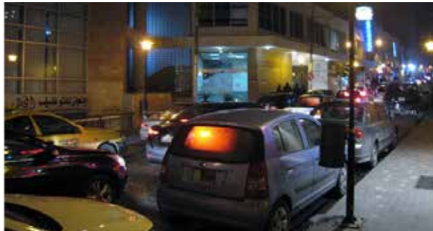
Figure 2: A line of cars at the beginning of Rainbow Street on a Friday night. Every evening, especially Thursday and Friday nights, cars filled with Ammanis drive down Rainbow Street.

The yellow taxi cabs, Harley Davidson motorcycles, pick-up trucks, small military buses, cars, and SUVs that come to the First Circle roundabout at the beginning of Rainbow Street have two choices: loop around the circle and return to Al Koliya Al Eilmiyya Al Islamiyya Street, or enter the one-way, cobblestone street filled with vehicles slowly making their way through the street. 46 "I'll take you to First Circle bes (only), not Rainbow