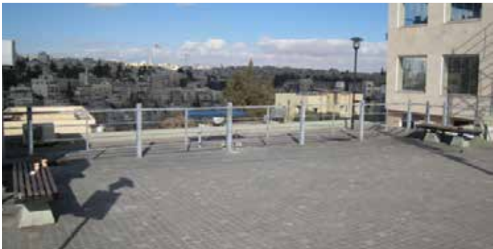
Figure 3: A scenic lookout on Rainbow Street.

Rainbow Street is a space where the Arab street and notions of cosmopolitanism collide. Asef Bayat, a sociologist who examines urban space and politics in the Middle East, calls the street in the Arab world the “chief locus of politics for ordinary people, those who are structurally absent from positions of power.” Rainbow Street is a space for ordinary Ammanis, who are structurally absent from neoliberal projects and elite, cosmopolitan consumption patterns. As a public street, it is a place for Ammanis of all socioeconomic backgrounds: the Sudanese shabab (unmarried young men) who hold rap battles at night, the Circassians who host break dancing competitions, the group of guitarists who gather nightly, the neighborhood children who race on their skates and dash through the long line of cars, the Syrian refugees who wait outside the Saudi Arabian consulate for visas, the employees who sit on the street during their cigarette breaks, the shabab who tease the American man who exercises on the street, and the families