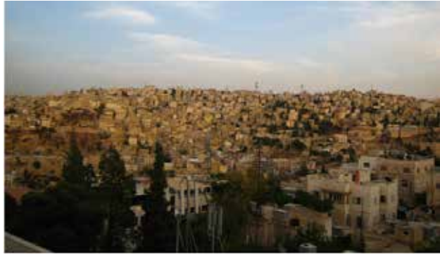
Figure 1: Amman is famous for its low-rise, limestone buildings.

increased from 4,000 in 1920 to 2.1 million in 2011 to 2.9 million in 2012. More recent migrants include Palestinian, Iraqi, Syrian, and Libyan refugees and Egyptian, South Asian, and Filipino migrant laborers. Because most inhabitants are recent migrants, they are not strongly affiliated with Amman, a trend noted by Daher. 16 Urban development projects demonstrate recent efforts to build a city identity for Amman. Certain projects—hotels, shopping centers, and business towers—emphasize Amman’s role as an emerging global city. Heritage-based projects like Rainbow Street emphasize Amman’s urban and social heritage in an attempt to link Amman—a relatively new city—to a firm past. Developers, inhabitants, and the municipality are trying to achieve a balance between highlighting Amman’s heritage and supporting its current role as a capital city.